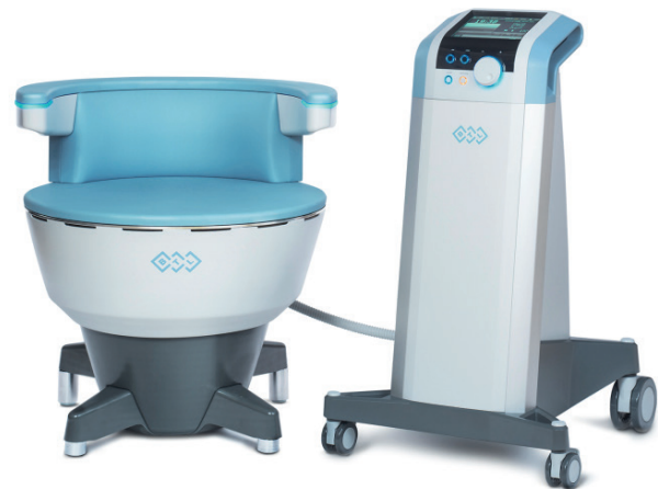
Figure 1: Subject device. The spiral coil is embedded in the center of the therapeutic chair and connected to the main unit which supplies the whole system with power and allows operator to adjust therapy settings.

outcomes, subject's posture was supervised by the therapist and verified by using device's positioning system to achieve optimal PFM contractions.